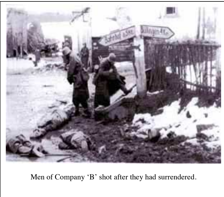
Men of Company 'B' shot after they had surrendered.

of the men were already standing along side of the tanks with their hands over their heads. One tank fired just as I got to the steps and knocked down about five men. A friend of mine had both legs shot out from under him. As he was calling for help, the tank swerved to the left and ran over him. It went right by me and kept going.”