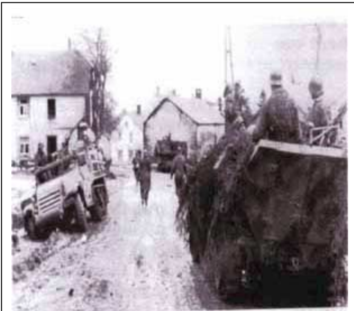
Kampfgruppe Peiper entering Honsfeld. The half-track on the right is part of the 14 th Calvary squadron.